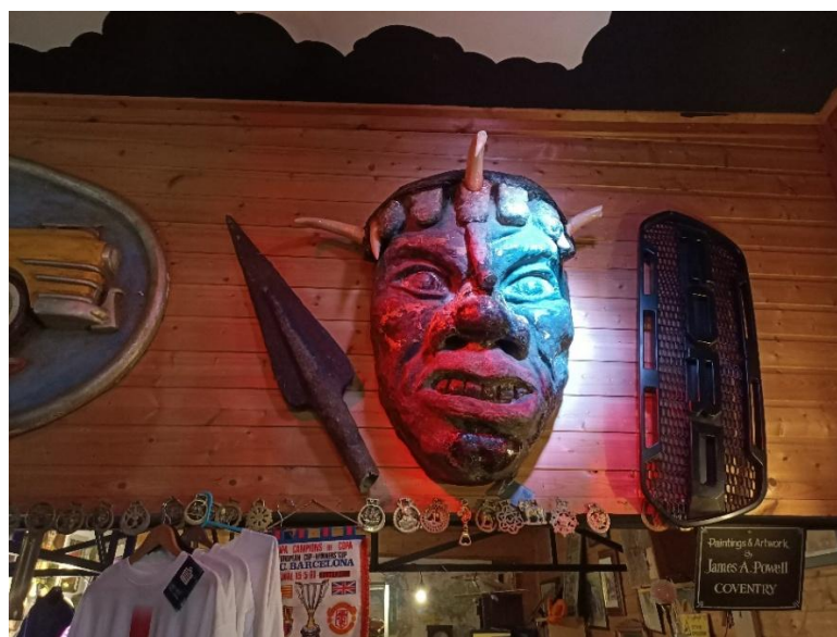
The Zulu in pride of place at the 888 Emporium, Coventry, 2025.

This article hopes to have cleared up some of the misinformation and rumours as to fate of the Coventry Zoo Zulu and hopefully it has done so. If you wish to see the Zulu statues remains, the head and spear can still be visited ( at time of writing ) at the 888 Emporium on the Foleshill Road, Coventry, allowing the legacy of Coventry Zoo to live on. Even in its fragmented state now, it still provides a tangible link to a time gone by, reminding the people of Coventry of a cherished era in their collective history.