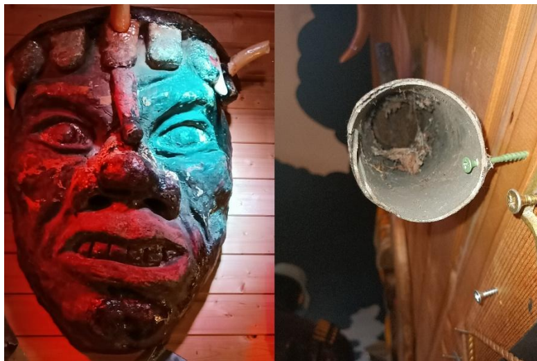
The Face (left) showing signs of degradation on its nose and chin but in otherwise remarkably good health (2025). The interior of the spear (right) showing how thin some of the material is (2025).