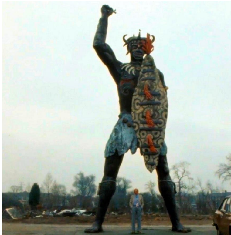
1981; The Zulu standing alone in the levelled remains of the Coventry Zoo site.