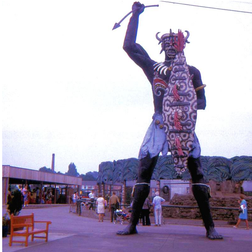
About 1971(?) - Photograph by the late William McSparron, kindly provided by his sons.

The figure was constructed of a fibreglass coating over a wire mesh, supported by H beams and light metal support tubing that ran throughout the structure [6] . The metal base of the Zulu was likely the heaviest part [6] as it was needed to hold the over-10-metre-high figure in place, assumedly contributing a large part of the 2.5 tons. The figure held a large painted shield in his left hand and in the other, a raised spear overhead, with his head adorned with a crown of synthetic animal horns.